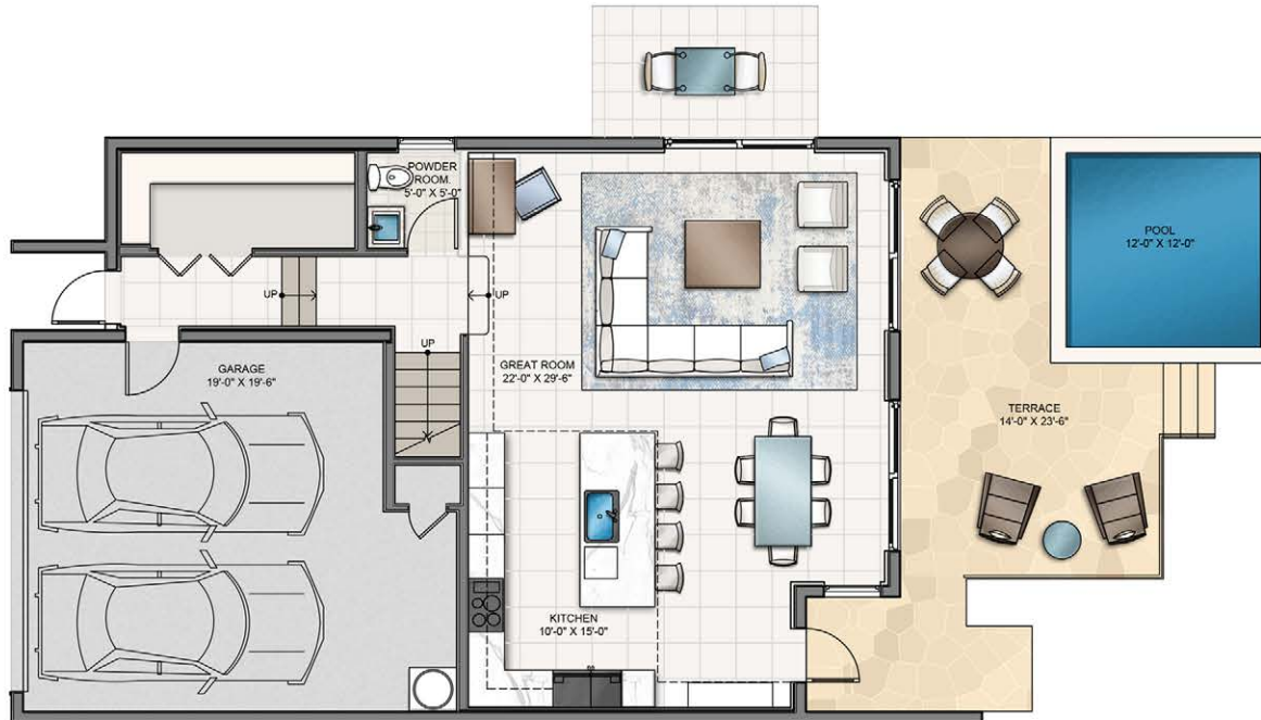
UNIT B - FIRST FLOOR